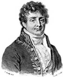
Jean B. Joseph Fourier (1768-1830)